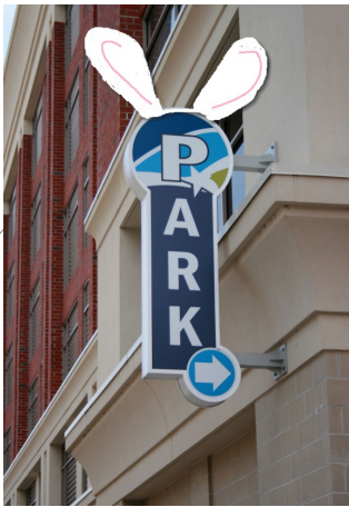
PARK Roanoke Welcomes Spring!