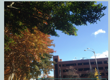
Elmwood Park Garage

PARK Roanoke wants to help increase awareness and safety. That's why we have created three safety pages on our website about personal safety, driving safety, and pedestrian safety. In addition, a free, downloadable publication is posted on our website entitled "How to Park: A Must-read Manual for Teen Drivers." This publication was developed by the International Parking Institute in conjunction with AAA and the AAA Mid-Atlantic Foundation for Safety and Education. This manual has excellent tips for both new and experienced drivers alike.