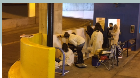
STUDENTS AT WORK PAINTING