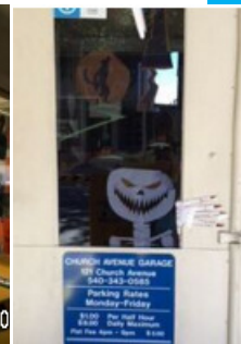
Church Ave Garage