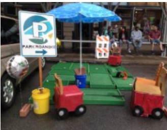
Roanoke Parklet 2013

PARK Roanoke thanks those who supported us during National Parking Day and the 2nd Annual Roanoke Parklet 2013 on September 20, 2013. Though the weather was rainy, it did not dampen anyone's spirits. Many businesses participated in creating a public space out of a parking spot. Participants repurposed various materials to turn the parking space into an inviting and interactive Parklet. PARK Roanoke used a discarded putt putt course to create their innovative Parklet.